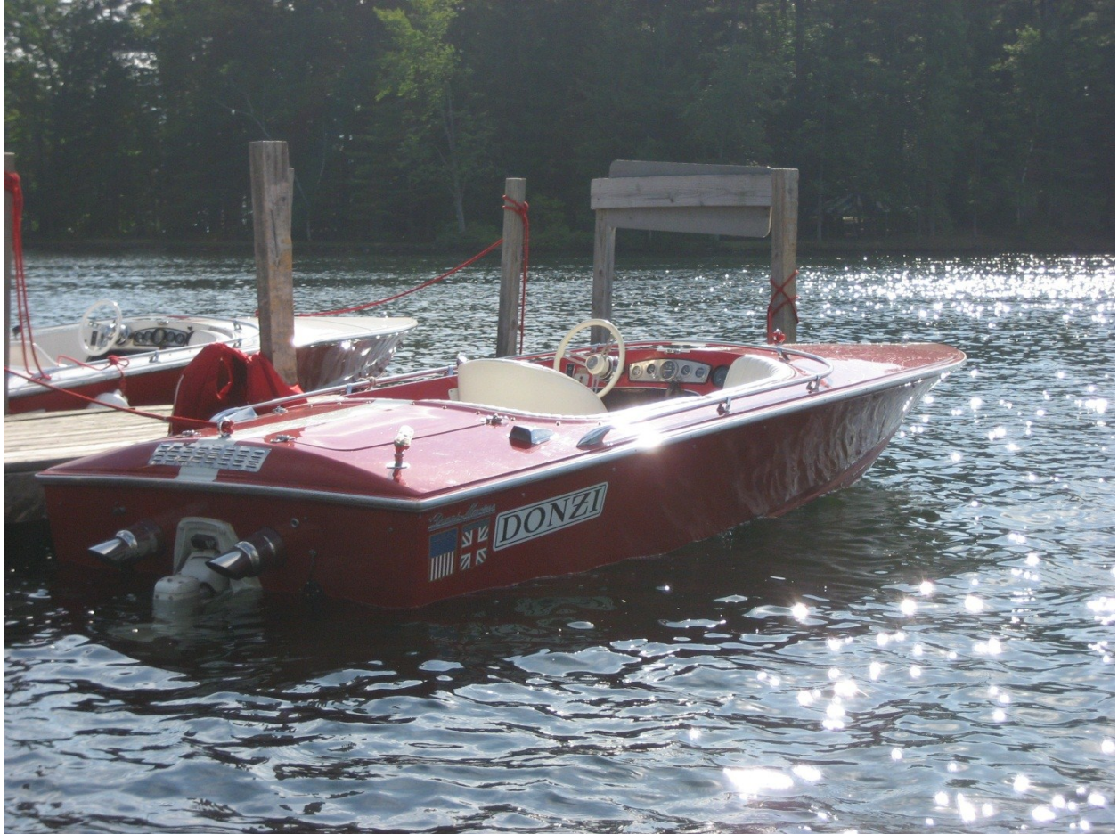
A 1967 16 showing the decals, script, steering wheel, dash panel and vents