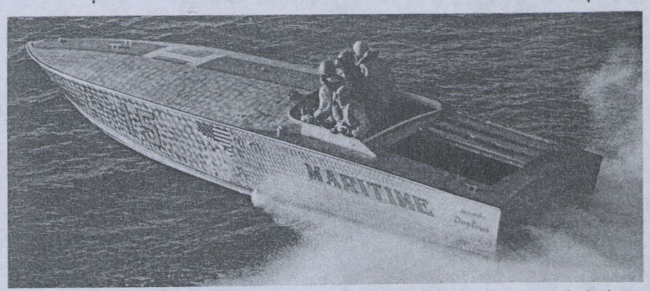
The very consistent Jim Wynne designed an aluminum boat and drove it to 2nd place

In 2nd place, about 17 minutes behind, was a new 32' aluminum hull named Maritime, powered by twin 400-hp Daytona Scarab en-