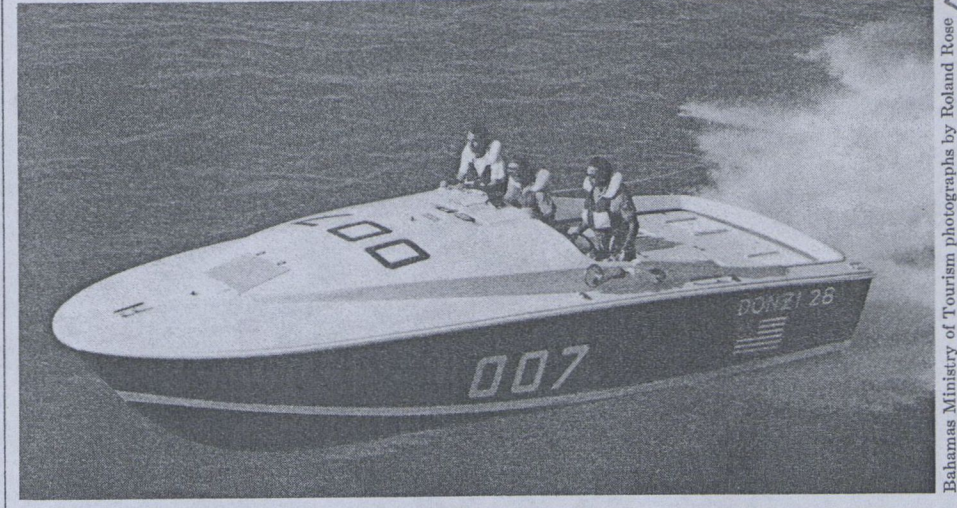
Aronow's new entry broke the record despite wandering off course with compass trouble.